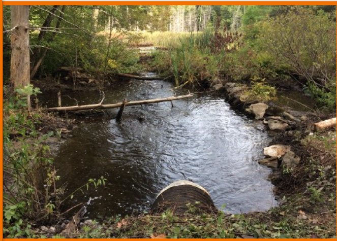
Recently Cleared Beaver Dam September 14th

Beaver Impoundment Removed It took five trucks, a backhoe, a chain saw, hand tools and about six personnel from Maine DOT and Inland Fisheries and Wildlife Department to break up the beaver dam which was clogging the culvert that drains the marsh across from Russ Point Road. There was concern that the wetland created by the beavers would potentially overflow Route 41 and cause damage. According to staff at Maine Inland Fisheries and Wildlife, the beavers were captured unharmed and were relocated to a more rural area.