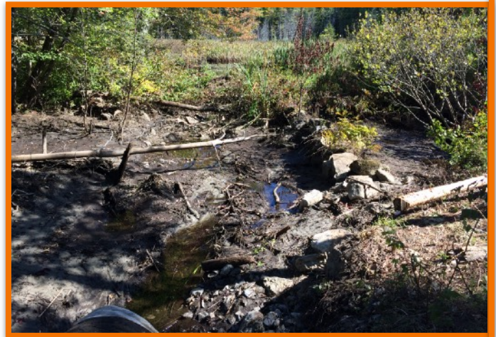
Beaver Dam 4 days later September 18th