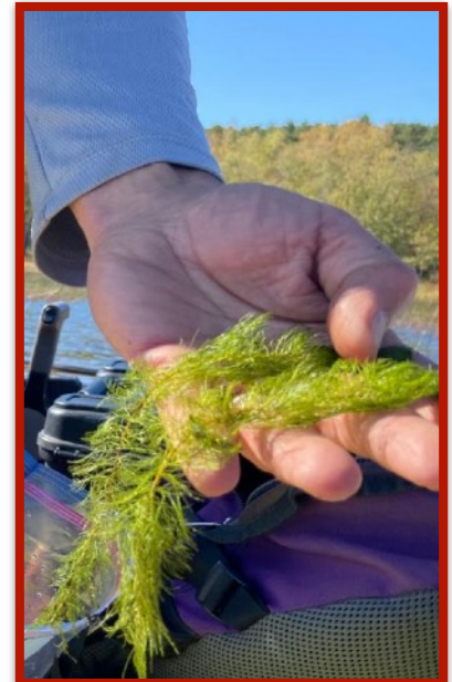
Androscoggin Milfoil (close-up)