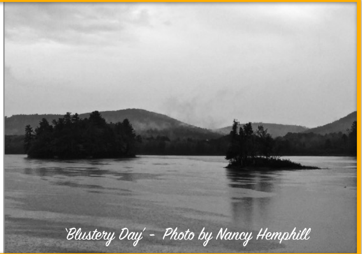
'Blustery Day'

A front swept through New England on Wednesday, September 30, bringing rain and winds gusting over 50 mph. Downed trees and branches caused over 114,000 Central Maine Power customers to lose power. Around Flying Pond, the power went out around 8 am, and it was not fully restored until the next day. Not only did this swift moving fall front bring down rain, wind, trees and power lines, it also successfully and sadly brought down the beautiful autumn foliage.