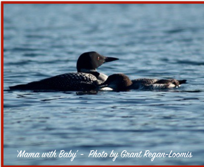
Mama with Baby'

We hope summer of 2021 will be a much better year for our feathered pair.