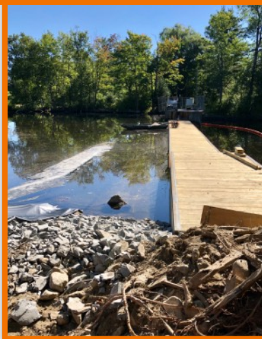
Construction at Long Pond