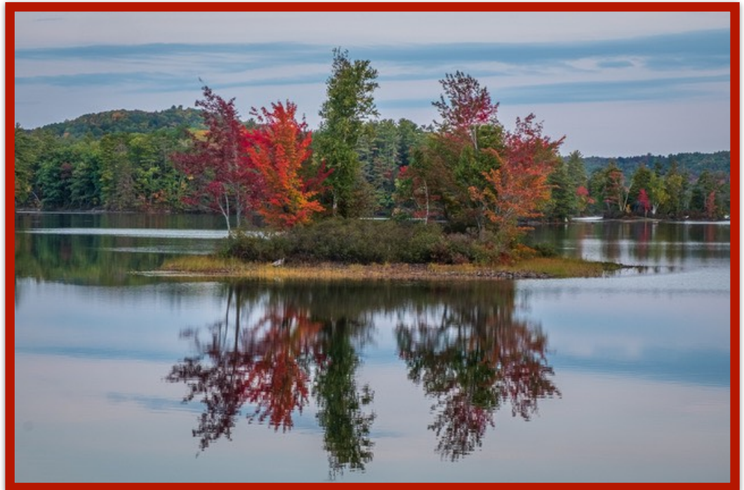
'Island of Color' - Cover Photo Courtesy of Karen Kurkjian