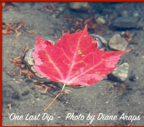
'One Last Dip'

The autumn red colors are caused by the amount of sugar in the leaf!