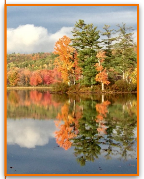
Kaleidoscope View' - by Nancy Hemphill