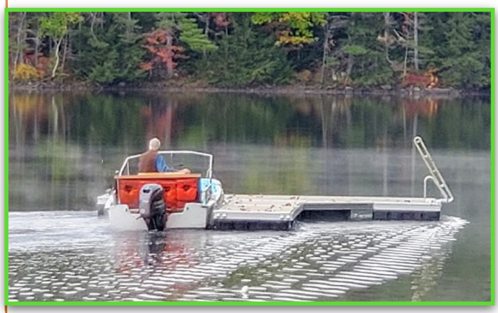
'Creative Dock Removal' - by Nancy Turner