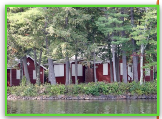
All Boarded Up' - by Kathy Schwab