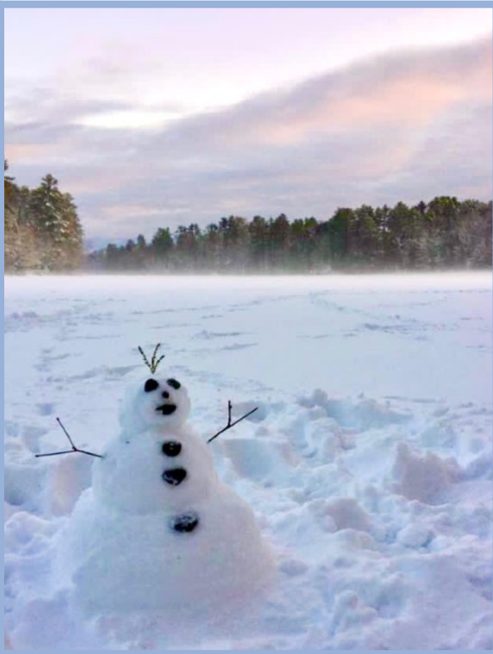
'Frosty at Sunrise' — by Beth Trehu