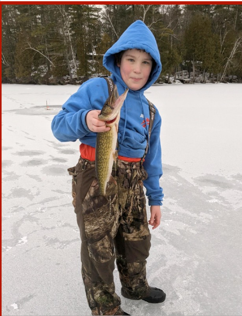
'Charlie Catches a Fish' — by Lori Huot