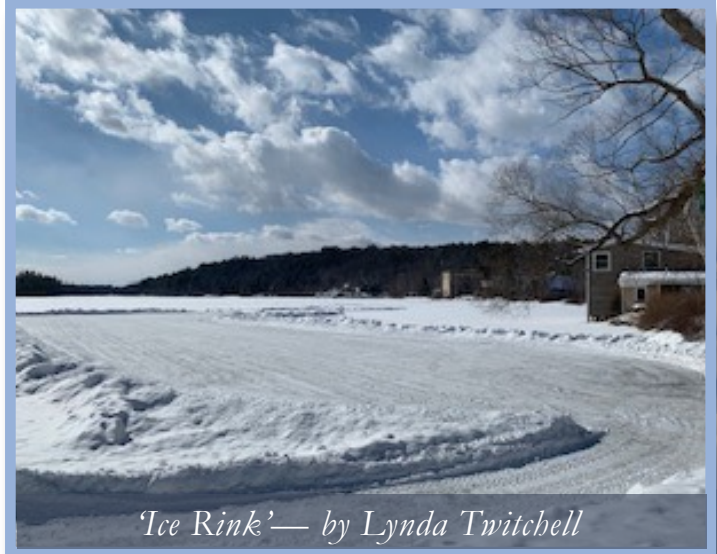
'Ice Rink' — by Lynda Twitchell

“ Flying Pond is the perfect place for a Winter getaway with friends! ”