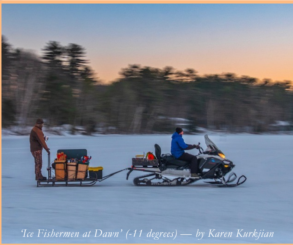
'Ice Fishermen at Dawn' (-11 degrees)

“Ice fishermen have photographers beat when it comes to early rising; this crew was all loaded up & heading to their favorite spot just before sunrise at subzero temperatures!”