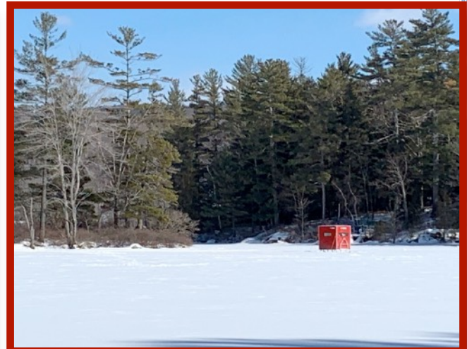
'Fishing Shanties'