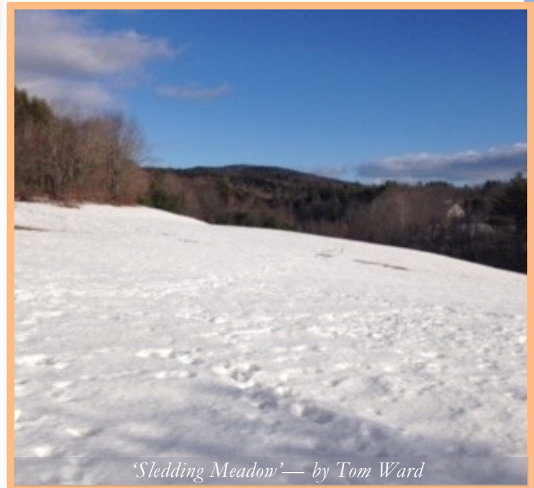
'Sledding Meadow' — by Tom Ward